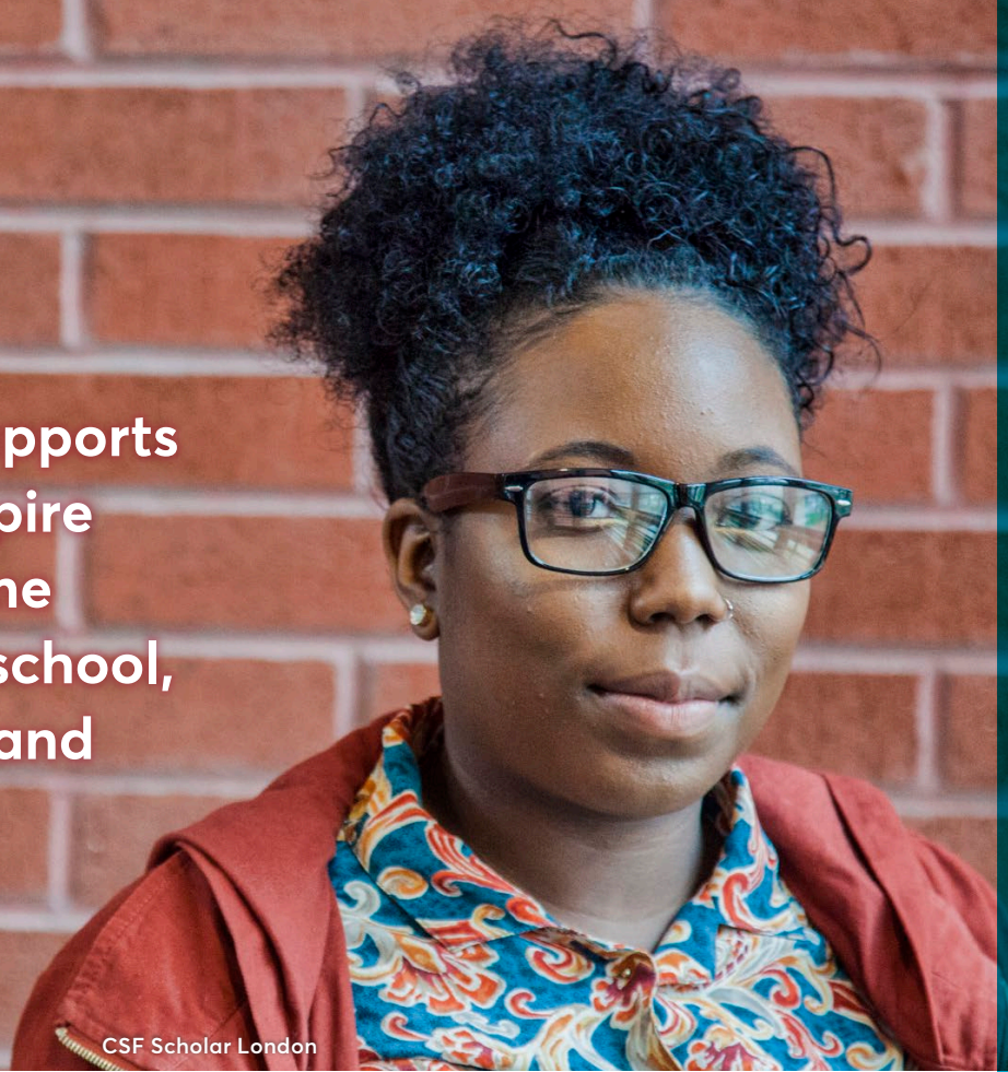
CSF Scholar London

We provide a unique integrated system of supports and scholarships to inspire underserved, low-income students to finish high school, graduate from college and succeed in life.