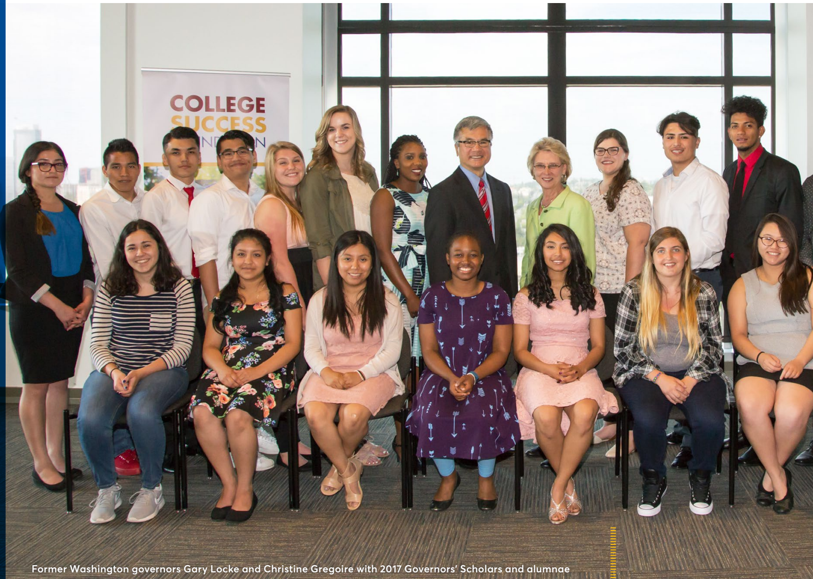
Former Washington governors Gary Locke and Christine Gregoire with 2017 Governors' Scholars and alumnae

We provide additional support for the most vulnerable student population.